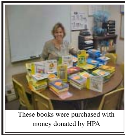
These books were purchased with money donated by HPA

HPA stands for Hinton Parents Association. This organization consists of parents of Hinton Community School students. HPA works very hard and generously donates time in raising money to put back into our school. Recent purchases made with this money are many books for use in guided reading for the elementary students, planners for the fifth and sixth graders, books for our school library, and accelerated reader tests. These materials benefit all of our students from discovergarten to twelve grade. This district is very fortunate to have concerned parents participate in HPA. Watch for the flyers that come home with students to announce meetings. HPA meets once each month on a Thursday. Hinton Community School's students and staff would like to extend a very big thank you to the HPA for helping to make a positive difference in our students' success!